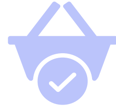
Non- Competition Agreements